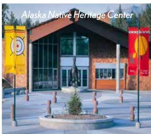
Alaska Native Heritage Center

Upon arrival in Anchorage, you will be transferred to the Hilton Anchorage Hotel, located right in downtown Anchorage. Depending on what time you book your flight, you will have the afternoon and evening free to explore Anchorage and enjoy dinner.