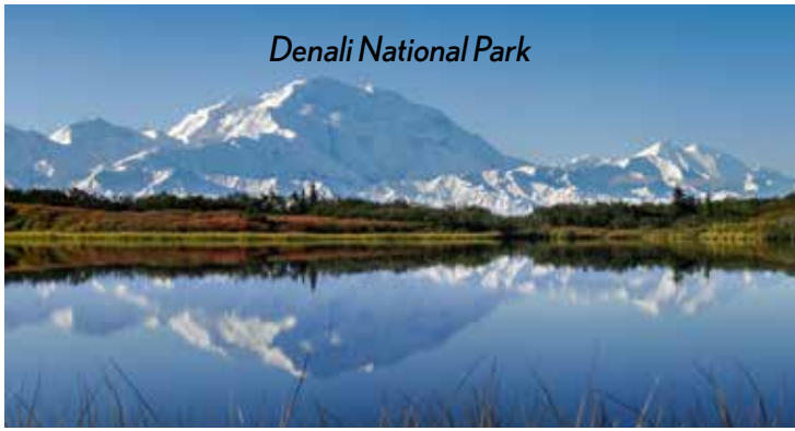
Denali National Park