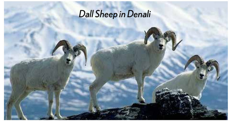
Dall Sheep in Denali

Denali National Park should be at the top of every adventurer's bucket list. This astounding destination extends over six million acres of preserved wilderness and is home to majestic Mount McKinley (now officially known as Mt. Denali or 'the Great One' in the Denaina Athabaskan language), the highest peak in North America. The pristine wilderness of Alaska is, perhaps, the last bastion of thriving populations of North American wildlife. With breathtaking scenery, unique wildlife sightings and an opportunity to immerse yourself in the pure, untamed wilderness of Alaska, we invite you to join the women of Olivia on a journey to Denali National Park.