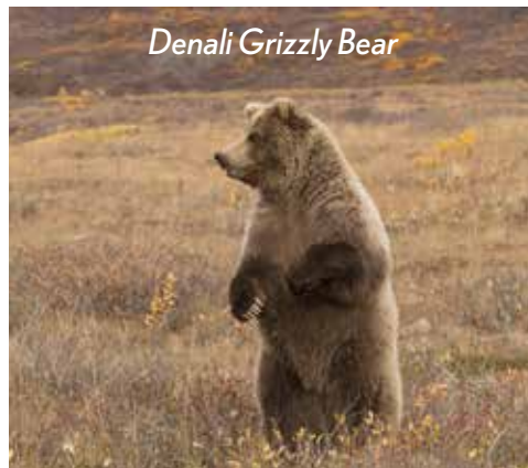
Denali Grizzly Bear