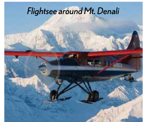
Flightsee around Mt. Denali