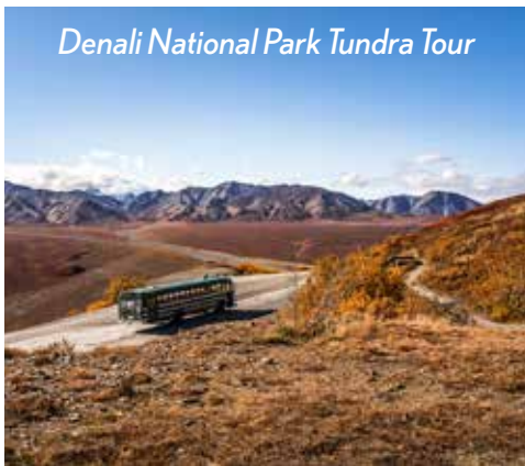
Denali National Park Tundra Tour

You will have a section of the restaurant and great, sweeping views of the park and Alaska Range as you dine in the company of Olivia women, your Olivia escorts and guides! Included Meals: B/L/D